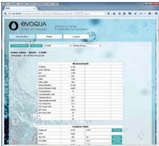
LIST VIEW WITH MEASURED VALUES AND PARAMETERS