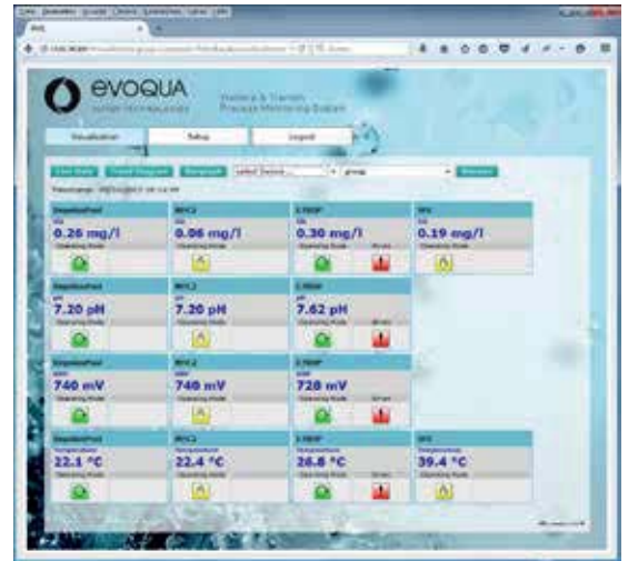
FREELY CONFIGURABLE GROUP VIEW