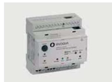
PROCESS MONITORING SYSTEM